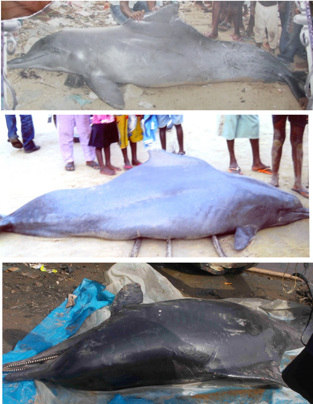
Figure 5. Atlantic humpback dolphins captured in artisanal coastal fisheries. (A) Juvenile landed at Imbikiri quarters, Brass Island, Nigeria, February 2012; (B) Adult specimen at Rotel fishing settlement, Nigeria, in November 2011. (Photos: Michael Uwagbae). (C) Freshly captured specimen landed at Londji landing site, Cameroon. (Photo: Isidore Ayissi).