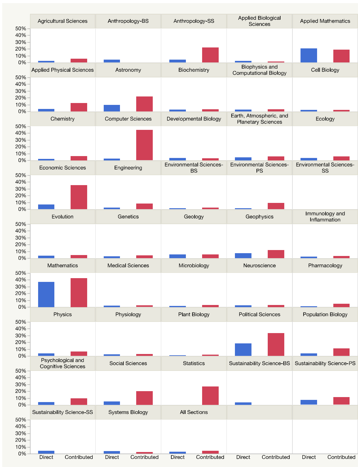
Figure 2. Percentage of uncited papers by section in their first two calendar years of publication (Blue=Direct, Red=Contributed). Numbers and percentages are found in Table 3.