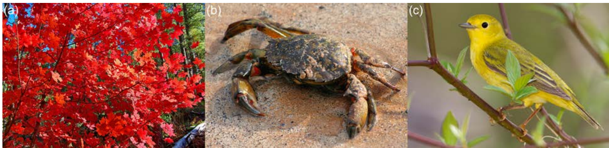
Figure 3. Citizen science data are collected on diverse organisms, including (a) trees, such as this red maple ( Acer rubrum , image by Al_HikesAZ/Flickr/CC BY-NC), (b) crustaceans, such as this shore crab ( Carcinus maenas , image by John Haslam/Flickr/CC BY), and (c) birds, such as this American yellow warbler ( Setophaga petechia , image by Laura Gooch /Flickr/CC BY-NC-SA).