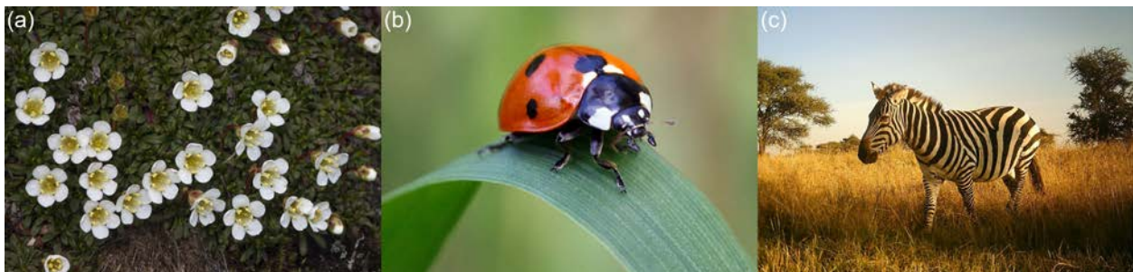
Figure 4. Citizen science data are collected on diverse organisms, including (a) flowering plants, such as this pincushion plant ( Diapensia lapponica), (b) insects, such as this Coccinellid, and (c) mammals, such as this plains zebra ( Equus quagga).