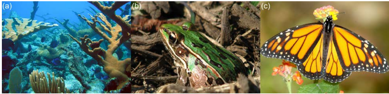
Figure 2. Citizen science data are collected on diverse organisms, including (a) coral reefs, such as this one in the US Virgin Islands (image by NOAA's NOS/Flickr/public domain), (b) amphibians, such as this southern leopard frog ( Rana sphenoccephala , image by Joe McKenna/Flickr/CC BY-NC), and (c) insects, such as this monarch butterfly ( Danaus plexippus , image by Alan Schmierer/Flickr/public domain).