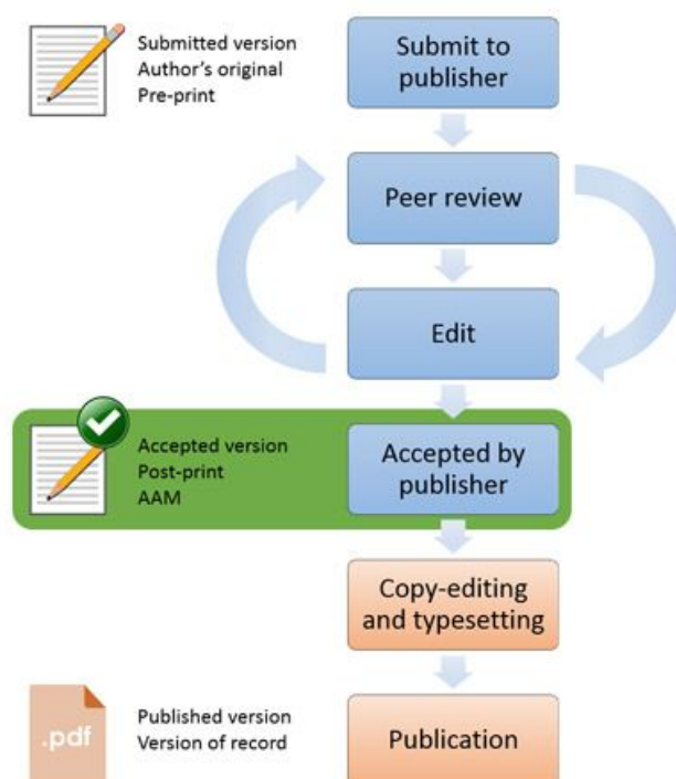
Figure 1. Publishing outline from HEFCE http://www.hefce.ac.uk/rsrch/oa/FAQ/

The traditional publishing workflow was originally established to facilitate proper scholarly review within a print publishing paradigm (Figure 1). This process is deeply enshrined in the scholarly communications process, and is carried out with very little variation amongst conventional publishers.