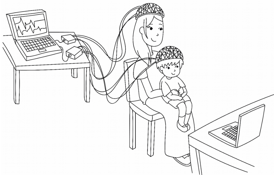
Figure 1. Experimental arrangement during the fNIRS session.