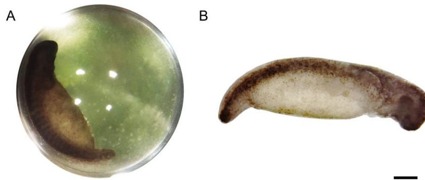
Figure 1. Typical stage 33 A. maculatum embryo from these experiments. A. Single egg capsule containing stage 33 embryo. Green hue is from intracapsular algae. B. Decapsulated stage 33 embryo. Scale bar: 1mm.

Statistical analyses were performed in the R programming language (R Core Team, 2017). Plots were generated using the ggplot2 package (Wickham, 2016). One-way anova followed by the non-parametric Games-Howell post hoc test (used due to violation of homogeneity of variance in the data) was performed using the "userfriendlyscience" package (Peters, 2017).