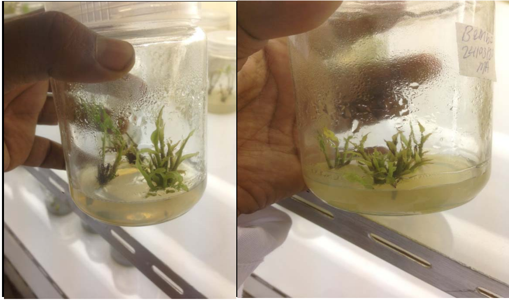
Figure 5. Multiplication of new leaf from initiated seed at 0.004 g /L BAP hormone.