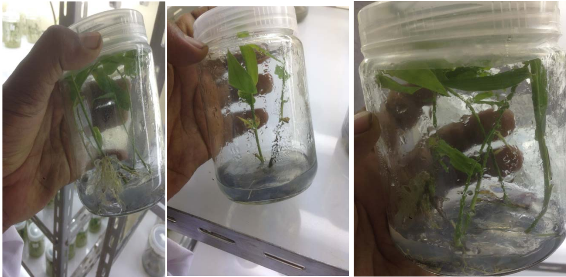
Figure 7. Root formation of Low land bamboo via IBA hormone after one month.