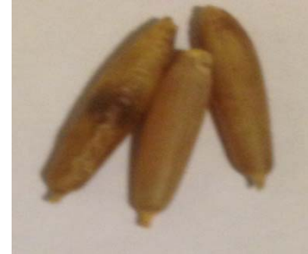
Figure 1. Seeds of Oxytenanthera abyssinica Figure 2. selected healthy seed