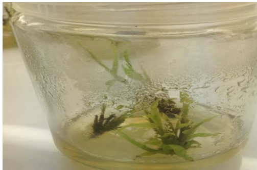
Figure 8. Browning of bamboo leaf due to phenol release.

rate and higher mean shoot number over PGRs free MS medium. Investigated BAP at 0.005 g/L showed a good multiplication rate. The effect of BAP in inducing multiple shoots has already been reported in bamboo species like Arundinaria callosa [33] and Bambusa oldhamii [34]. Interestingly, the synergistic effect of BAP and KN for increased shoot multiplication rate and proliferation was also reported on Bambusa tulda and Melocanna baccifera [35]. The occurrence of phenol exudation at the cut ends of explants was the main problem faced during the multiplication study as shown in Figure 8 . This phenolic exudation delayed the time required for sub-culturing accompanied with gradual browning of the shoots leaf and medium that eventually ends up in death. The IBA was found nice in both rooting percent and number of roots produced, which is in agreement with reports of Parthiban et al. and Diab and Mohamed [36,37].