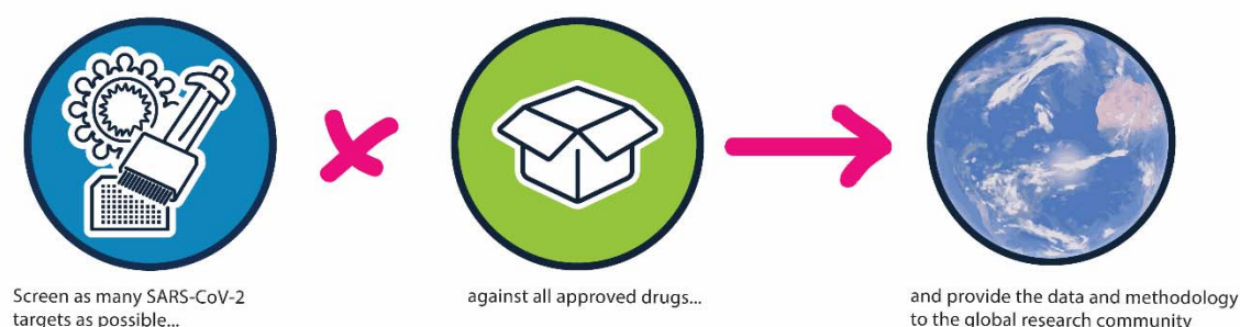
Figure 1. OpenData portal objective. The goal of the OpenData portal is to provide actionable data and validated methodologies to the global research community to support rapid development of therapeutics against SARS-CoV-2.

The assays that have been developed to date cover a wide spectrum of the SARS-CoV-2 life cycle ( Figure 2 ), including both viral and human (host) targets, grouped into the following five categories based on different mechanisms of experimental design: viral entry, viral replication, in vitro infectivity, live virus infectivity, and counter-screens, which could flag false positives due to assay interference artifacts or cytotoxic effects. These assays encompass protein-based assays such as the SARS-CoV-2 spike protein-ACE2 interaction and viral enzyme activity assays, in addition to cell-based pseudotyped particle entry and live virus cytopathic effect assays. As additional assays are validated and screened, this list will be expanded and updated. Importantly, all assay documentation including assay overview, methodology and detailed assay protocols are available, and readily retrievable, on the OpenData site to facilitate adoption and ensure that other laboratories can replicate these assays ( Table 1 ).