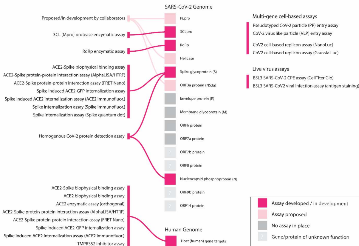
Figure 2. NCATS SARS-CoV-2 assays currently employed to address a range of both viral and host targets. Overview of established assays and those in development. These include assays for specific viral targets, viral-host interaction assays, viral detection assays and viral cytopathic effect and replication assays, among others.

In total, over 10,000 compounds are being tested in full concentration-response ranges from across multiple annotated small molecule libraries including: (1) The NCATS Pharmaceutical Collection (NPC), a library of 2,678 compounds approved for use by the Food and Drug Administration and related agencies in other countries 12,13 ; (2) a collection of 739 anti-infective compounds with potential anti-coronavirus activity that have been reported in the literature as repurposing candidates; and (3) an annotated/bioactive collection of diverse small molecules with known mechanisms of action, including as small molecule probes and experimental therapeutics designed to modulate a wide range of targets, such as natural products, epigenetic-associated compounds or compounds developed for oncology indications 14,15 . Together, these libraries yield 9,958 compound responses, 8,624 of which represent structurally unique compounds, of which 1,820 (21%) are approved for use in humans with an additional 989 (11%) having entered human clinical evaluation (Phase 1-3 trials). Importantly, of these unique compounds, 5,224