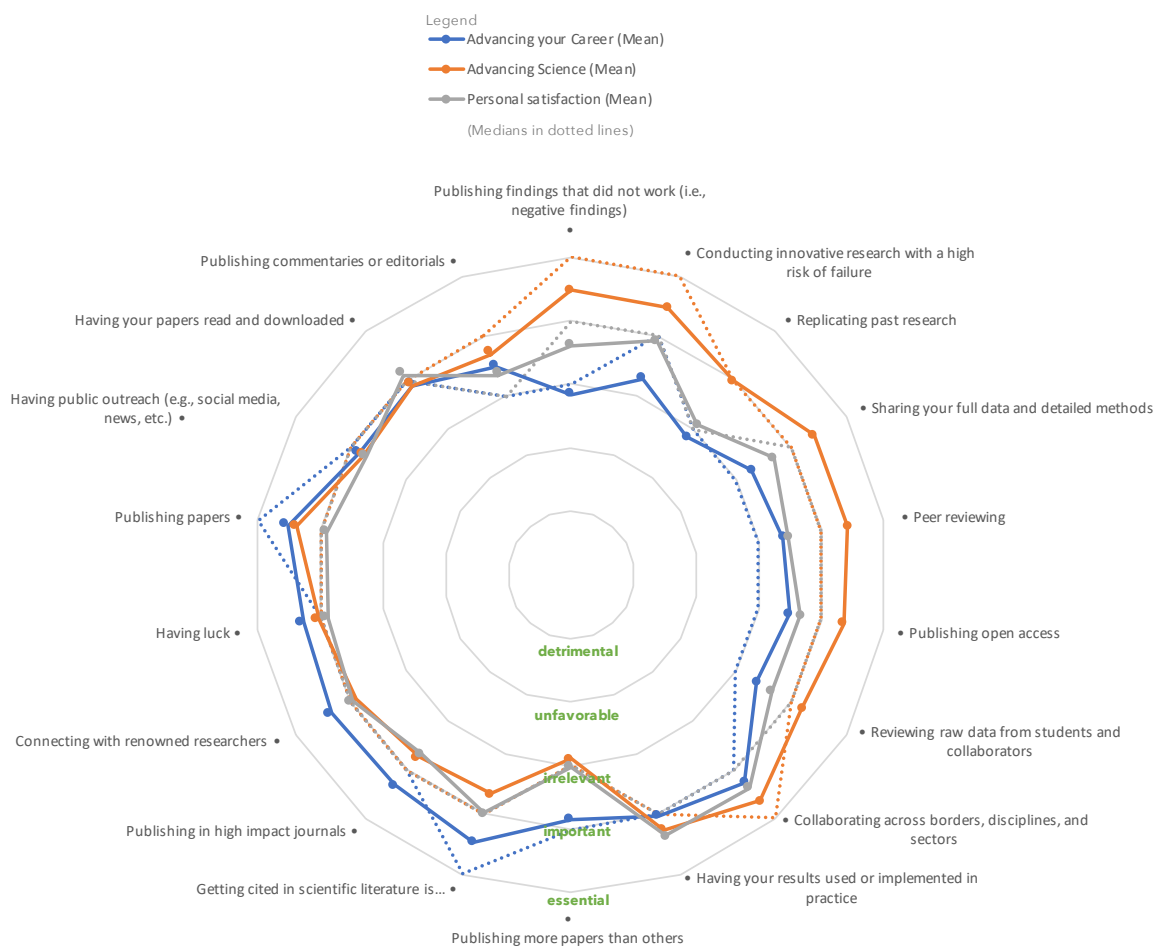
Figure 2. Mean and median ratings on each dimension for each statement.

The survey also allowed participants to comment after each item. These comment boxes were rarely used, but the few answers collected provide richer insights about some of the elements included in the survey.