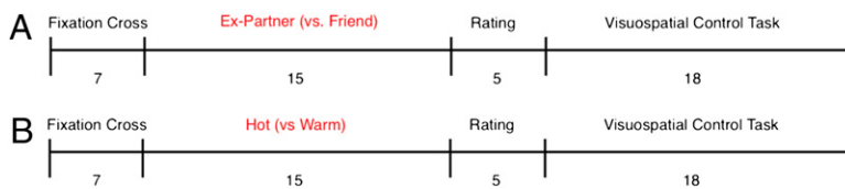
Fig. 1. Time course of Social Rejection and Physical Pain trials. The Social Rejection and Physical Pain tasks each consisted of two consecutively administered runs of eight trials (i.e., 16 total trials). The order of the two tasks was counterbalanced across participants. (A) Each Social Rejection trial lasted 45 s and began with a 7-s fixation cross. Subsequently, participants saw a headshot photograph of their ex-partner or a close friend for 15 s. A cue phrase beneath each photo directed participants to think about how they felt during their break-up experience with their ex-partner or a specific positive experience with their friend. Subsequently, participants rated how they felt using a five-point scale (1 = very bad; 5 = very good). To reduce carryover effects between trials, participants then performed an 18-s visuospatial control task in which they saw an arrow pointing left or right and were asked to indicate which direction the arrow was pointing. Ex-partner vs. Friend trials were randomly presented with the constraint that no trial repeated consecutively more than twice. (B) The structure of Physical Pain trials was identical to Social Rejection trials with the following exceptions. During the 15-s thermal stimulation period, participants viewed a fixation cross and focused on the sensations they experienced as a hot (painful) or warm (nonpainful) stimulus was applied (1.5-s temperature ramp up/down, 12 s at peak temperature) to their left volar forearm (for details, see Methods ). They then rated the pain they experienced using a five-point scale (1 = very painful; 5 = not painful).