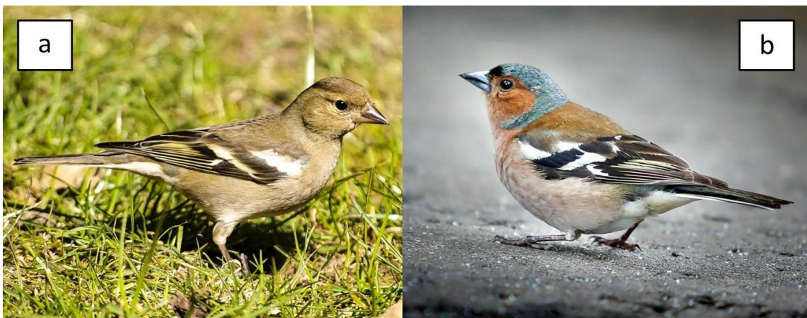
149 150 Fig. 1. Female (a) and male (b) chaffinch ( Fringilla coelebs ); photo credits a. Kathy Büscher b. Klimkin Sergey .

139 After communicators had finished the species identification test, they were asked to 140 estimate the species literacy level of primary school children aged 9 or 10 years old (i.e. their average 141 achieved identification score: the number of correct identifications), and they were asked what the 142 desired species literacy level in this group would be (i.e. the desired average achieved identification 143 score). Communicators were also asked whether or not they had targeted primary school children 144 aged 9-10 in their communication in the past 5 years, to investigate the influence of experience with 145 the target group on estimation accuracy. Finally, we explored the importance placed by biodiversity 146 communicators on species literacy, by asking them whether they agreed with the statement "it is 147 important for people to recognize many animal species" on a 10-point scale and offering them the 148 possibility to elaborate their answer with arguments.