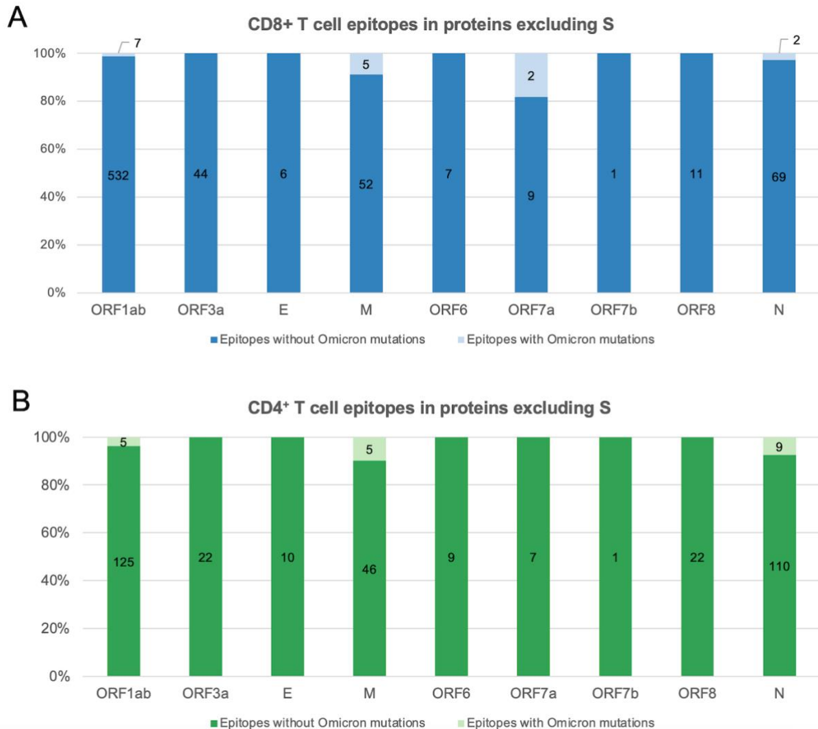
Figure 2. Percentage of SARS-CoV-2 T cell epitopes derived from proteins besides S with and without Omicron-defining mutations: (A) CD8 + T cell epitopes. (B) CD4 + T cell epitopes. Only epitopes of canonical lengths (CD8 + : 8-12 residues and CD4 + : 15 residues) were included in the analysis. Omicron-defining mutations (that also include deletions) were obtained from https://covariants.org .

the acquired T cell immunity across proteins would be expected to remain largely intact against Omicron.