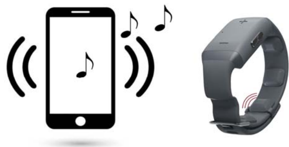
Figure 1. Bimodal stimulation. Tones are played from a phone app; a haptic wristband vibrates simultaneously with each tone. The location of the vibration is a function of the frequency of each individual tone, such that the frequency map is spread across the skin. Participants in the control condition listened to tones from the phone app but did not receive a wristband and were given no haptic stimulation.

Treatment was administered through a phone app (sounds) and wristband (vibrations on the skin). Participants opened the app and listened to tones for ten minutes each day. Experimental participants listened to tones while feeling corresponding vibrations on their wristband (Figure 1). The app played the tones while sending spatially and temporally corresponding vibrations to the wristband via Bluetooth. These vibrations were spread evenly across the wrist in a logarithmic manner, such that an octave spanned the same spatial distance regardless of its frequency. Although the wristband has only four vibrating motors, frequencies were mapped onto one of 256 different spatial locations, accomplished by leveraging a haptic illusion (Alles 1970; Rahal, Cha, and El Saddik 2009; Luzhnica et al. 2017). Specifically, an illusory location is a point on the wrist that is felt by the wearer of the wristband even when a motor is not located directly at that point. We stimulate these illusion locations by turning on two motors, one on either side of the illusion location, at specific amplitudes such that the wearer feels as if a single point somewhere between the two motors is vibrating.