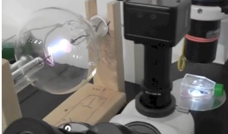
Enclosed Gas Plasma Tube Delivering Frequency-Specific Pulsed Electric Fields to Cancer Cells In Vitro