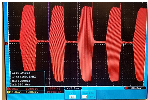
Pulse Output of Plasma Tube at 160 kHz, 50 % Duty Cycle

OPEF signals were generated with the following electronic equipment: Tenma 72-7655 DC Power Supply, F125 Square Wave Generator (Atelier Robin), duty cycle 50%, OM2 custom RF transmitter (Plasmasonics) (20) operating with a carrier frequency of 27.12 MHz, 300 Watt PEP Class C custom RF amplifier (Plasmasonics) that typically provides about 1000 volts to the Phanotron plasma tube, MFJ customized Antenna Impedance Tuner (Plasmasonics), and a Large Phanotron plasma antenna tube (Bill Chev, billplasm tubes.com) . The Phanotron tube is evacuated and backfilled with helium and placed 18 inches (45.72 cm) from the center of the heated microscope stage where the leukemia cells were placed for treatment.