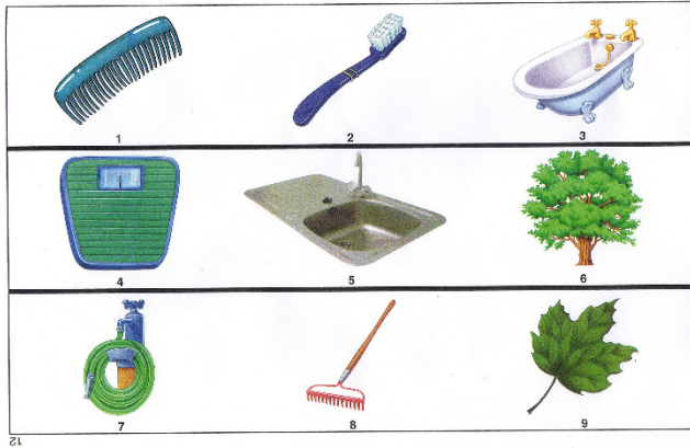
Fig. 1 Example trial from the Picture Concept Task. The subject has to identify the common association between 1 item from each row