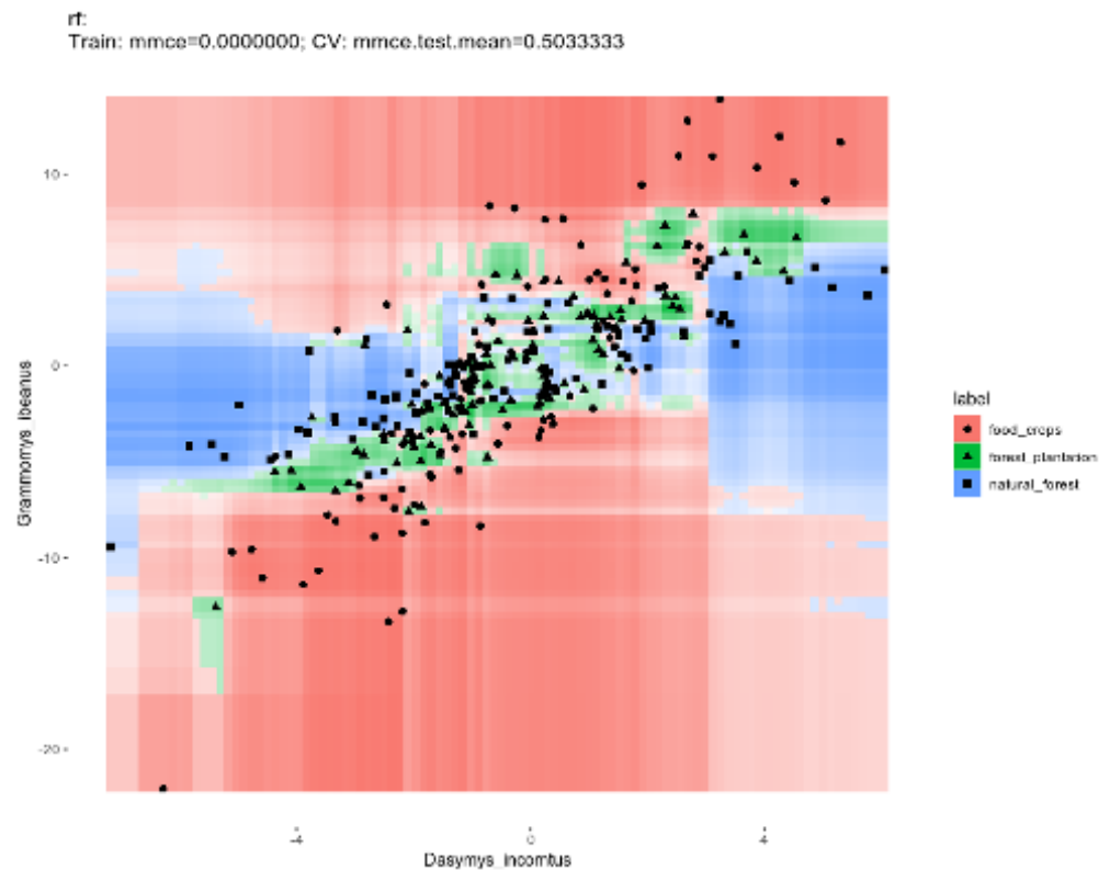
Figure 5. Classifier decision boundary.