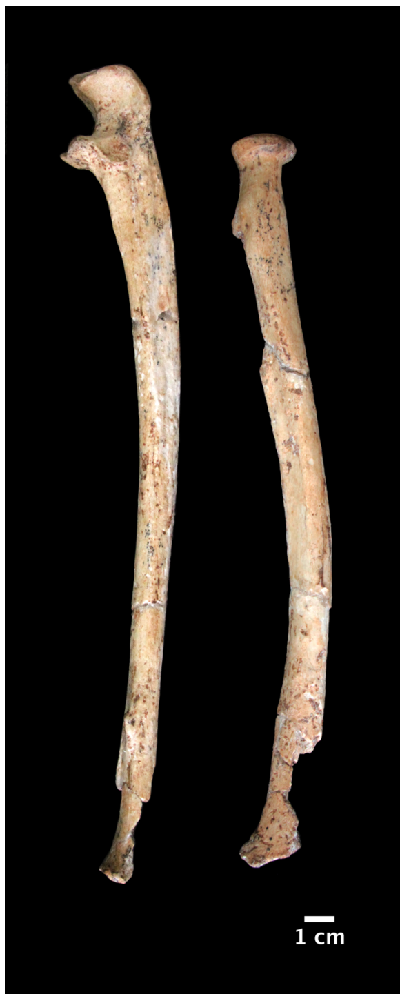
Figure 2. The curved left forearm bones of the StW 573 Australopithecus skeleton shown with superior toward the top of the image. The ulna (left) is near-lateral view and radius (right) is in anterior view.