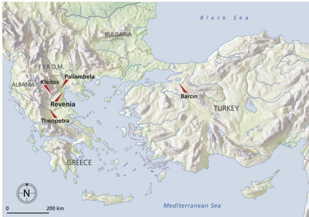
Figure 1: North Aegean archaeological sites investigated in Turkey and Greece.

Early Greek Neolithic sites, such as Franchthi Cave in the Peloponnese (14), Knossos in Crete (15) and Mauropigi, Paliambela and Revenia in northern Greece (16-18) date to a similar period. The distribution of obsidian from the Cycladic islands, as well as similarities in material culture, suggest extensive interactions since the Mesolithic and a coeval Neolithic on both sides of the Aegean (17). While it has been argued that in situ Aegean Mesolithic hunter-gatherers played a major role in the ‘Neolithisation’ of Greece (14), the presence of domesticated forms of plants and animals is a good indication of extra-local Neolithic dispersals into the area (19).