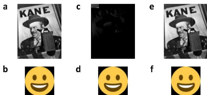
Figure 3 | Image files used in our experiment. a, b , show the raw images which were compressed, encoded and synthesized into DNA blocks. The Citizen Kane poster and Smiley Face emoji were of size 9,592 and 130.2 bytes, and had dimensions of 88×109 and 56×56 pixels, respectively. c, d , show the recovered images after sequencing of the DNA blocks and the post-processing phase without homopolymer error correction. Despite having only two errors in the Citizen Kane file, we were not able to recover any detail in the image. On the other hand, one error in the Smiley Face emoji did not cause any visible distortion. e, f , show the image files obtained after homopolymer error correction, resulting in the original file.

error rate was 12%, a significant improvement over previous architectures 11 . After the consensus formation stage, the error rate reduced to a mere 0.02% without any error-correction redundancy. The three errors in the 17 codewords were subsequently corrected using homopolymer checks, thereby producing error-free reconstructed images. The images reconstructed with and without homopolymer checks are shown in Figure 3.