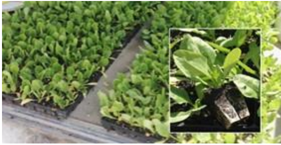
Figure 1: Thirty-eight-day-old fodder beet (cultivar 'Rivage') seedlings in model 144 Transplant Systems cell trays.