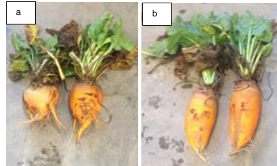
Figure 3: Transplanted (a) and Precision-drilled (b) fodder beet ('Rivage') plants at harvest. The forked root system (sprangling) of the transplanted crop is obvious and in spite of an apparent visual volume difference dry matter yields were similar.

The extra speed of growth and higher potential yield, particularly as indicated by intercepted radiation (Fig. 5), is commonly reported in sugar beet transplant trials. The most likely yield increase arises from both quicker leaf canopy closure, reduced weed pressure and particularly the potential to raise seedlings earlier than is feasible by direct seed-sowing in the field. In this proof of concept trial we did not attempt to exploit this earlier plant germination component offered by transplanting.