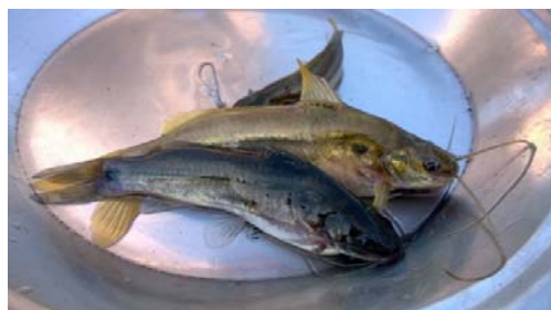
Fig 1A: Female brooders of M. dibrugarensis