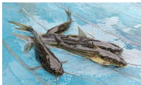
Fig 1B: Male brooders