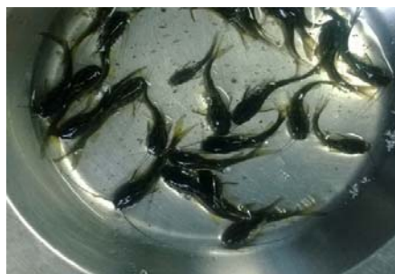
Fig 5: Fingerlings