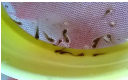
Fig 4: 15 th day fry