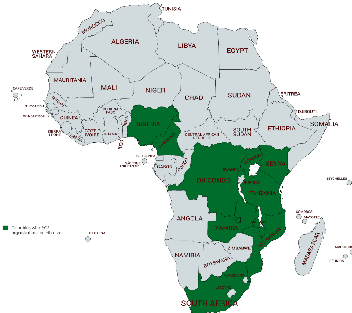
Figure 1: African countries where RCS organisations or initiatives were identified