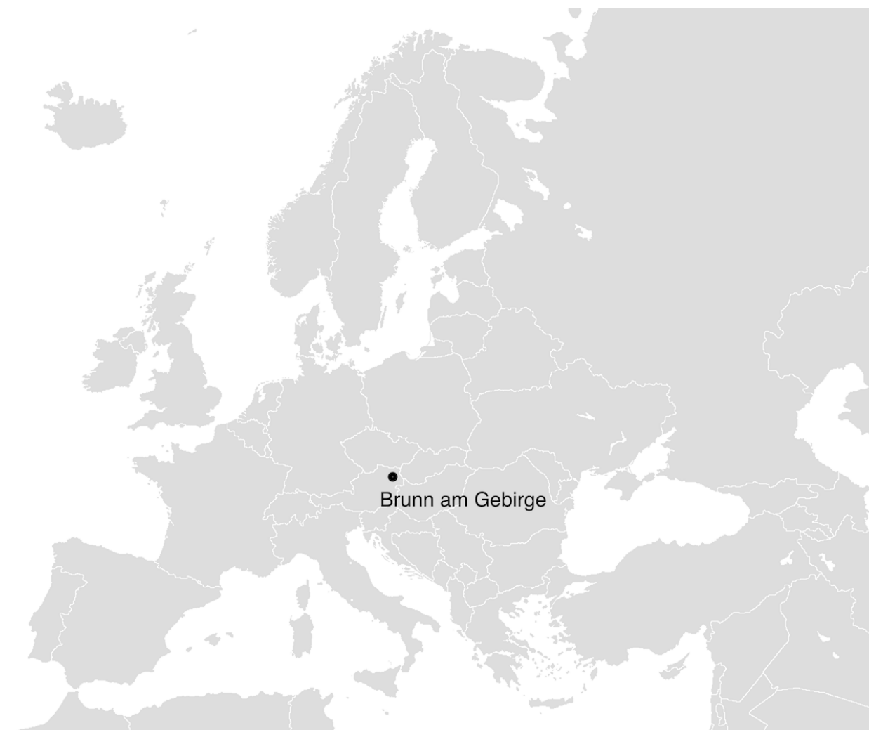
Figure 1. The location of Brunn am Gebirge, Wolfholz site on the map of Europe.