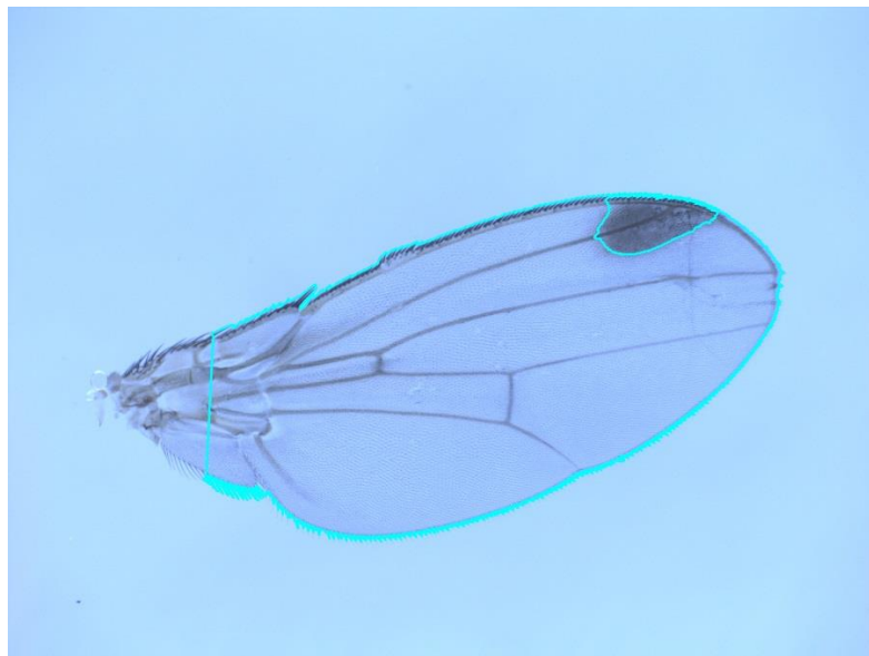
Figure 1: Drosophila suzukii wing from a population of Sapporo (Japan, native population) raised at 28°. In blue there is the wing and spot areas identified by our Python algorithm.

In order to remove the proximal part of the wing, which is usually deteriorated during the removal of the wing from the thorax and may bias wing-size estimates, two landmarks were placed in ImageJ 1.51j8 (Rasband, 2012), that correspond to landmarks 1 and 3 in Fraimout et al. (2018) and a line between them was traced to discard all the proximal part of the wing. Then, a semi-automatized script in Python 3.6.1 was written to extract the wing and spot contours. Their respective areas were estimated by the Green's theorem in the function contourArea of the OpenCV library (Bradski and Kaehler, 2000).