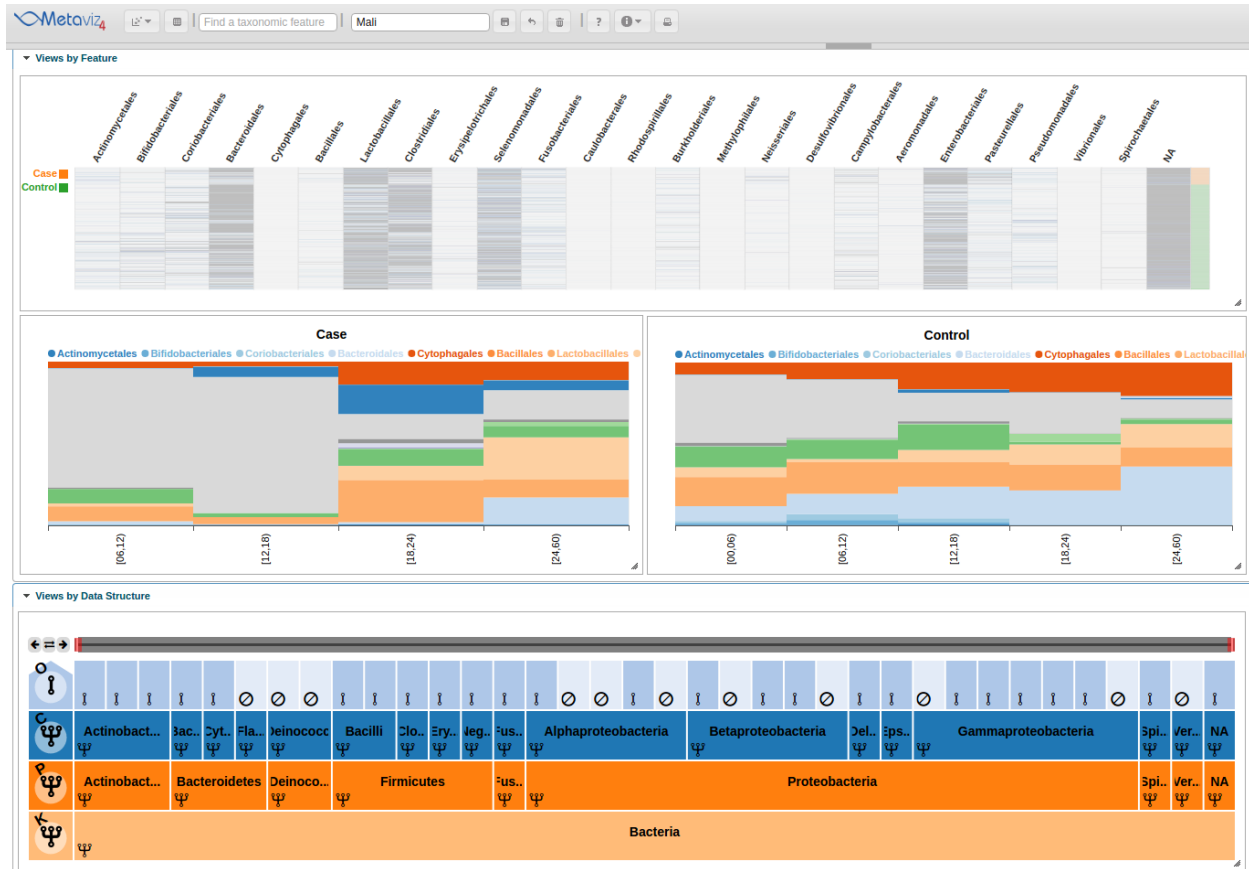
Supplementary Figure 4: Mali msd16s visual analysis Bifidobacteriales and Coriobacteriales show greater abundance in control samples as compared to the case samples. Pasteurellales displays increased abundance in the case samples as compared to the distribution in the control samples. With metagenomeSeq , we find support for these conclusions with Pasteurellales (2.82, 5.4 \times 10^{-4} ), Neisseriales (1.77, 1.4 \times 10^{-2} ), and Bifidobacteriales (-1.59, .439) but not with Coriobacteriales (-.848, .439). From the stacked plots, the proportion of Enterobacteriales among case samples in age range 6-12 and 12-18 months is much higher than that in the similar age ranges in the control samples. In case samples, Pasteurelles shows higher proportion in the case samples as compared to the controls in the 18-24 age range. For all age ranges, Bacteroidales displays greater proportion in the control compared to case samples. This figure is available at http://metaviz.cbcb.umd.edu/?ws=EUARocVProf .