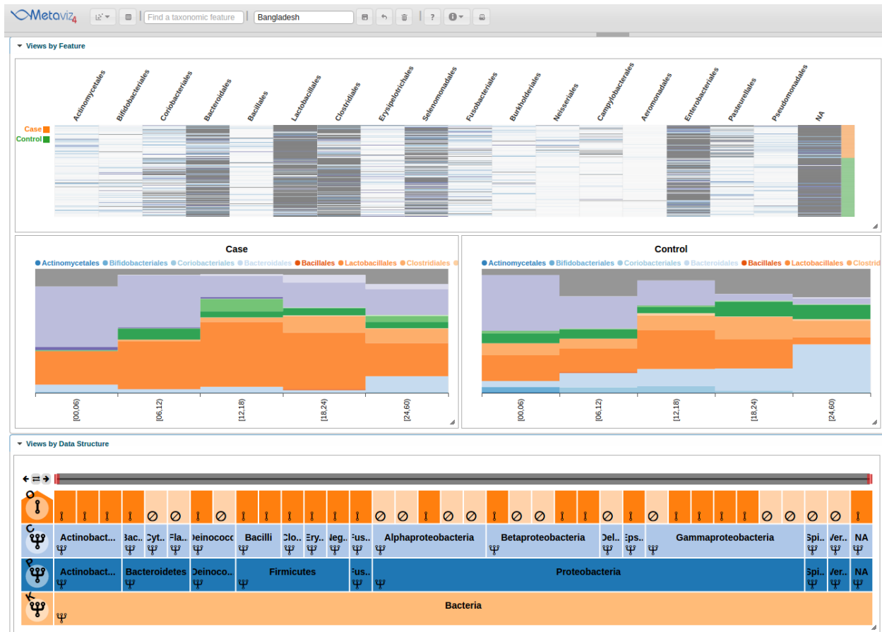
Supplementary Figure 1: Bangladesh msd16s visual analysis From the heatmap, Actinomycetales, Lactobacillales, Selemononadales, Neisseriales, Campylobacteriales, Enterobacteriales, and Pasteurellales appear more abundant in the case group than the control group. Correspondingly, Bifidobacteriales, Coriobacteriales, Bacteroidales, Clostridiales, and features without an annotation (NA) display higher abundance in the control samples as compared to the case samples. Using metagenomeSeq , Campylobacteriales (log fold-change: 2.30, p-value: 2.46 \times 10^{-4} ), Enterobacteriales (1.51, 6.95 \times 10^{-5} ), Neisseriales (1.92, 3.55 \times 10^{-5} ), and Pasteurellales (2.40, 4.96 \times 10^{-11} ), Coriobacteriales (-1.27, 6.96 \times 10^{-4} ), Bacteroidales (-1.23, 3.77 \times 10^{-4} ), and Clostridiales (-1.20, 6.95 \times 10^{-5} ) are differentially abundant while Actinomycetales (.973, .007), Lactobacillales (1.24, .655), Selemonadales (.245, .511), Bifidobacteriales (-.198, .75) and NA (-.596, .752) are not. Looking at the stacked bar plots, Bacteroidales shows a higher proportion in control than case samples at all intervals after 0-6 months. Also, the control samples exhibit a greater proportion of unannotated (NA) in age intervals beyond 0-6 months. Finally, Clostridiales has lower proportion in case than control samples for the intervals of 0-6, 6-12, and 12-18 months then similar proportion for the last two time points. This is available at http://metaviz.cbcb.umd.edu/?ws=iGPCfth9nQn .