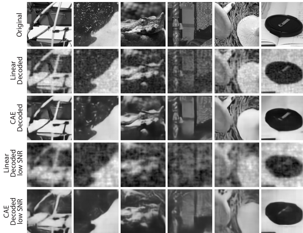
Figure 6: Noisier Neural Responses. We used the same spatial encoding model but divided the firing rate by a factor of 10 before generating Poisson spikes (reducing the input to the Poisson distribution reduces the signal to noise ratio). Randomly chosen decoded images are shown for the original encoder (rows 2+3) and the noisier encoding model (rows 4+5). The CAE pulls out features that are not obvious in the noisier LD images.